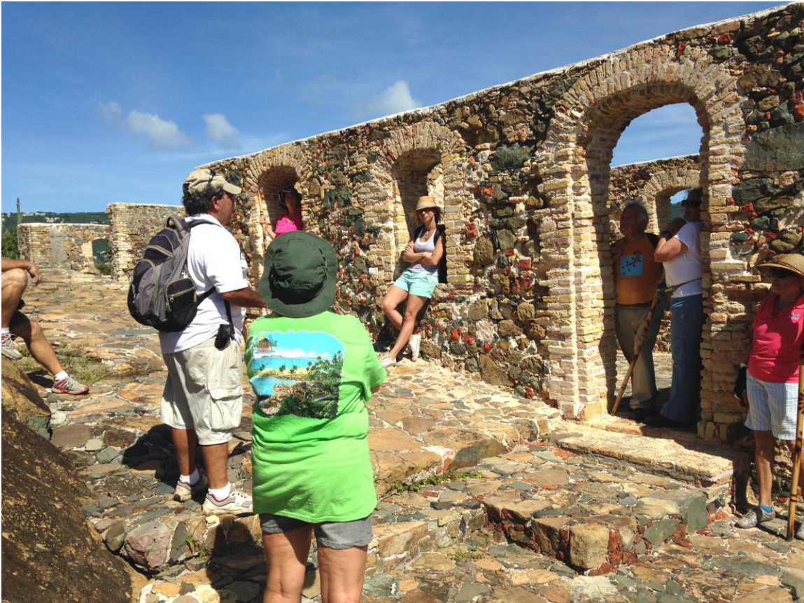
2014 Hassel Island Members Tour.

Sea Tow Virgin Islands plays a big part in the tours, ferrying visitors over the harbor to the site of the Creque Marine Railway, Careening Cove or the Garrison House area. Doc, Charles, Marisa, and Bob led numerous tourists, locals, adults, children in church groups, and school groups to Hassel Island. Tour interest is growing exponentially, with January of 2015, by itself, offering tours to over 75 individuals. In addition, local schools continue to show a growing interest in tours.