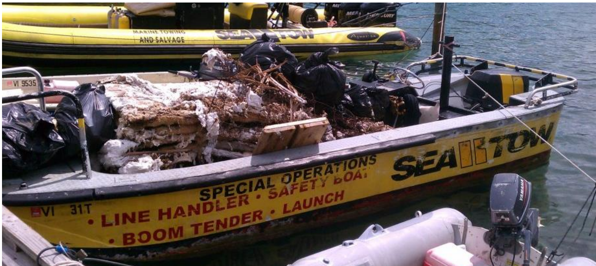
Alan Wentworth's Sea Tow Boats Hauling away trash collected on Hassel Island.