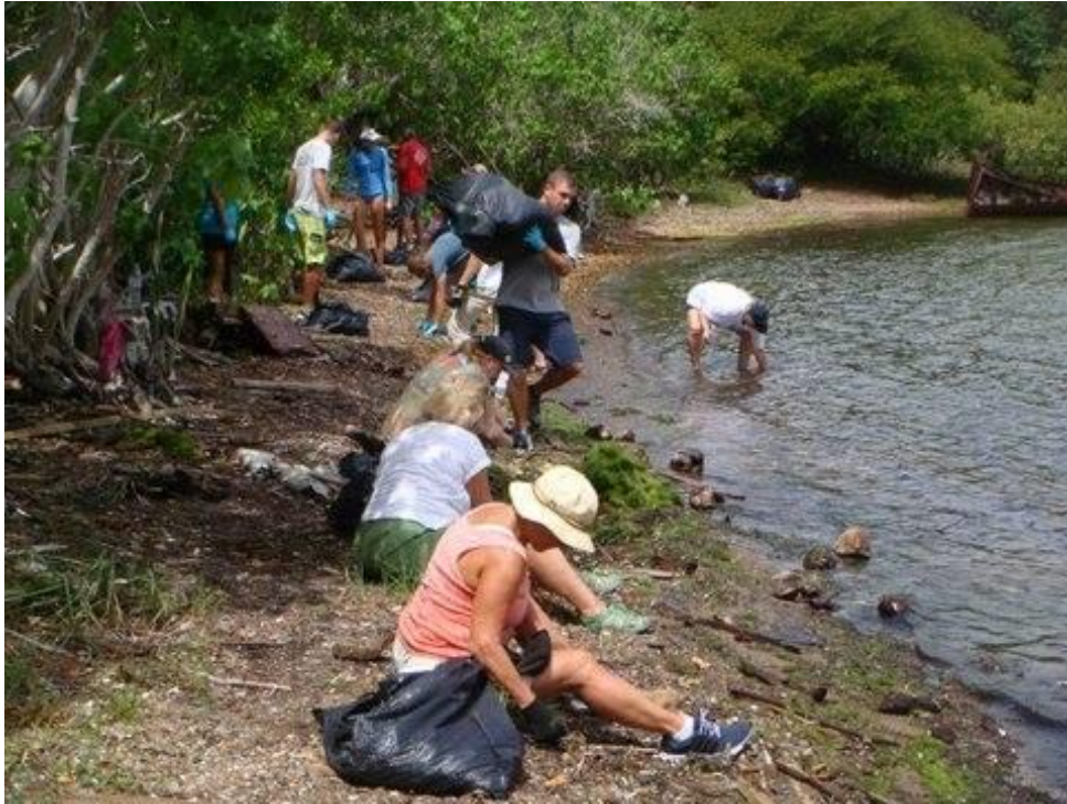
Volunteers Collecting Beach Trash from Careening Cove on Hassel Island.