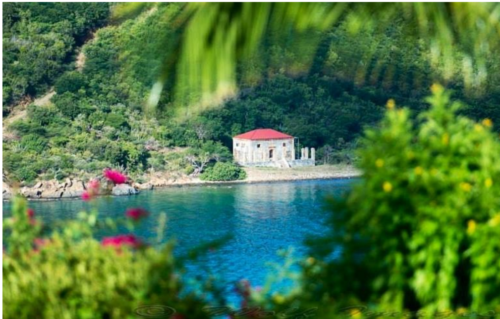
The Garrison House after Restoration.

Partnering with University of the Virgin Islands, Marine Advisory Services, and Coast Week Island Clean-Up Coordinators, in three events, over 90 volunteers attended, collecting and removing over 300 bags of trash, not to mention other items washed up on Hassel Island Shores.