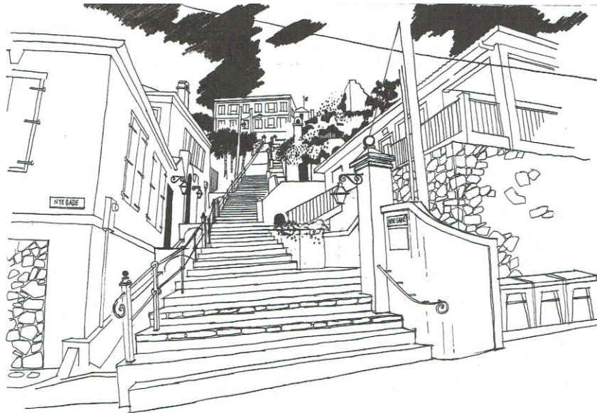
Proposed Bred Gade Step Street Restorations.

This report covers the period 3 rd quarter of 2013 to the end of 2014.