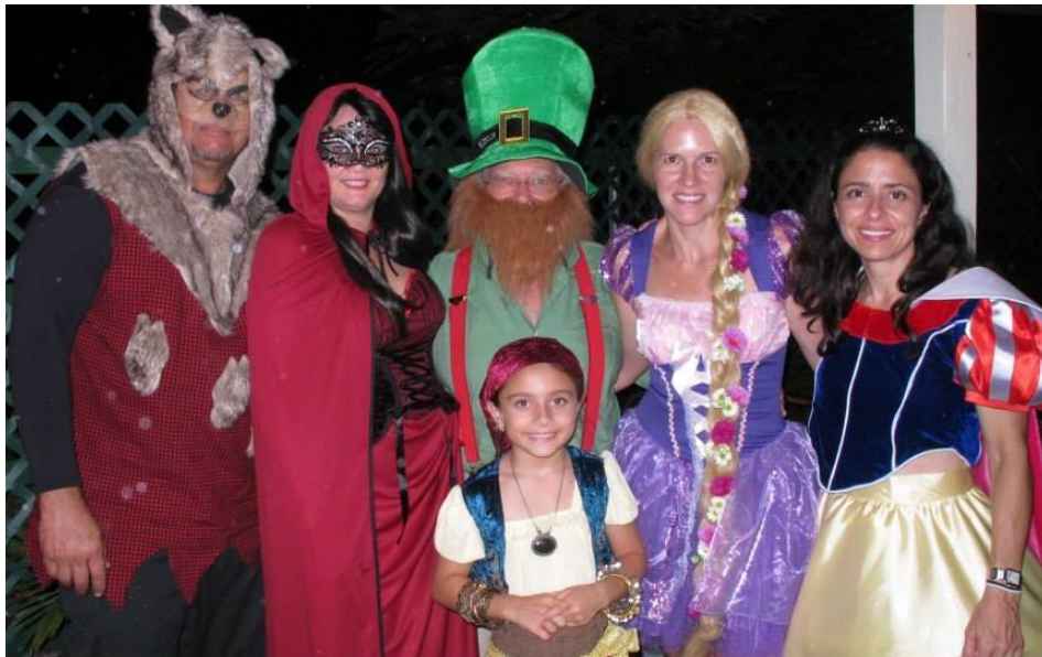
2014 Halloween Gala, "Myth, Magic, and Storybook Characters."

The 2014 Halloween Gala Fundraiser at Oceana was once again a great success. As of Dec 31, 2014, the gross revenue was $45,260. The net profit for the Trust after all expenses were accounted for was $28,117. Unfortunately, this marked a decrease in revenue of roughly 45%, mirroring the current economic situation of the territory.