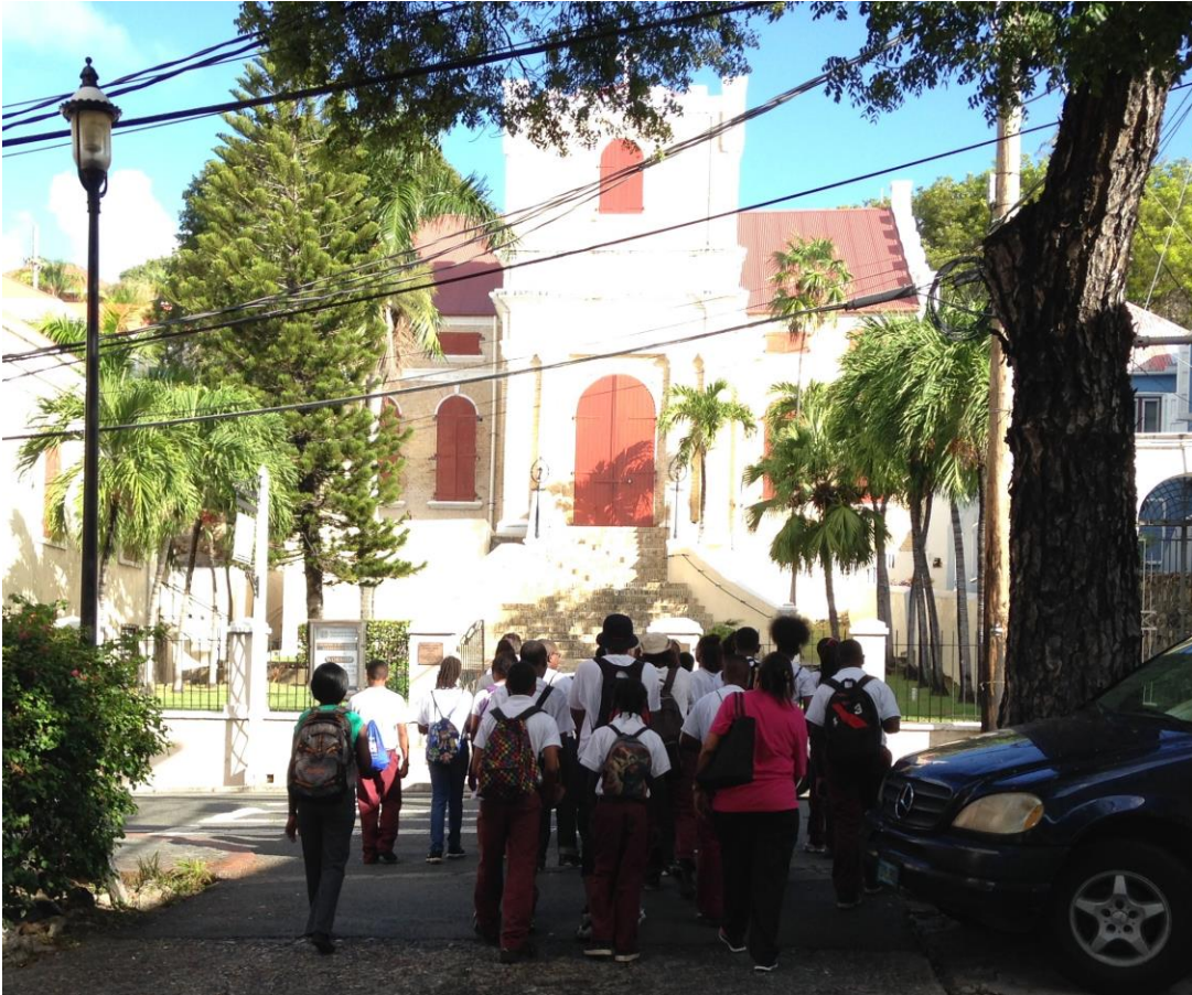
2014 Addelita Cancryn Tour of Downtown.