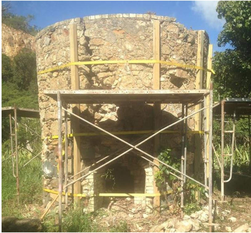
The Lime Kiln Prepared for Restoration.