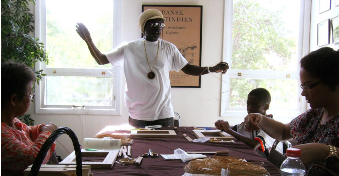
2014 Furniture Caning Class.

identified less than 10 professional caners in the territory, of whom many are advanced in years, there is a need to preserve the historical art/craft of chair caning. Second, there are many antiques in the territory which are caned, and either need repair now or will require it. Third, with an unemployment rate of 13.2 percent, there are many people who can learn this art, and gain a rapid return on their time and tuition investment in this workshop.